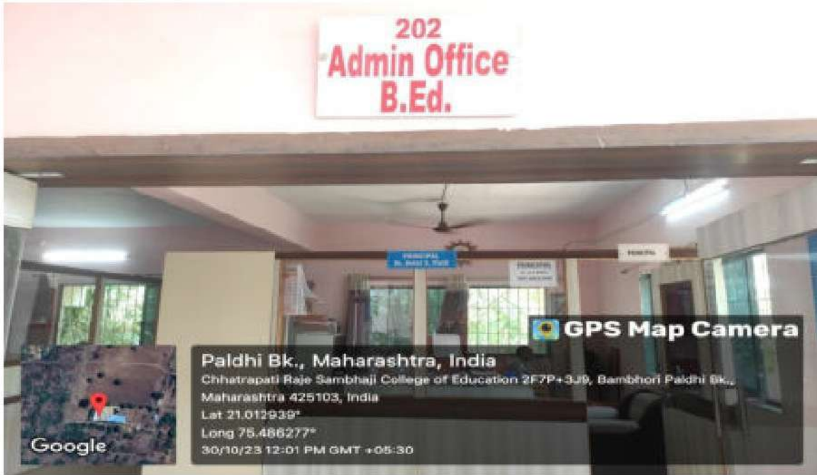
LED Bulb in office