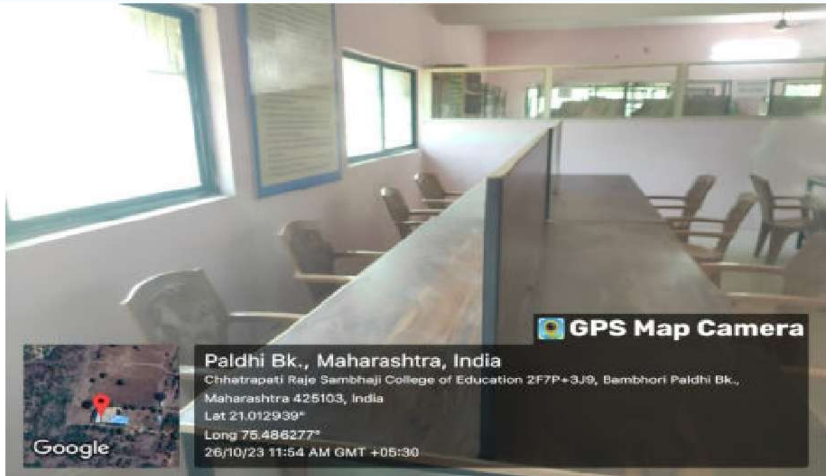
Well Ventilated and Sun lighted Reading Room Greenery Campus of College

Gat No.181, Bambhori, Near K.B.C. North Maharashtra University Main Gate, Jalgaon Phone No. (0257)2234120