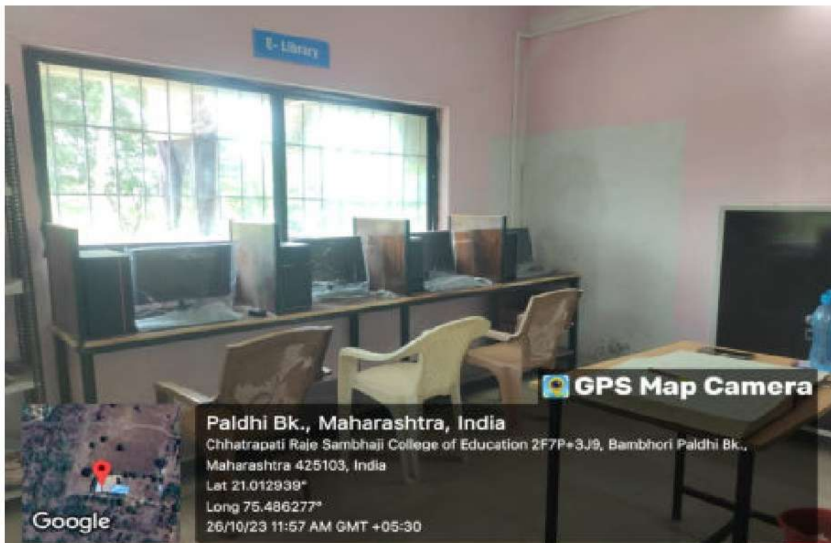
Well Ventilated & Sun Lighted E-Library

[Signature] IGAO Coordinator Chhatrapati Raju Sambhaji College of Education, Jalgaon