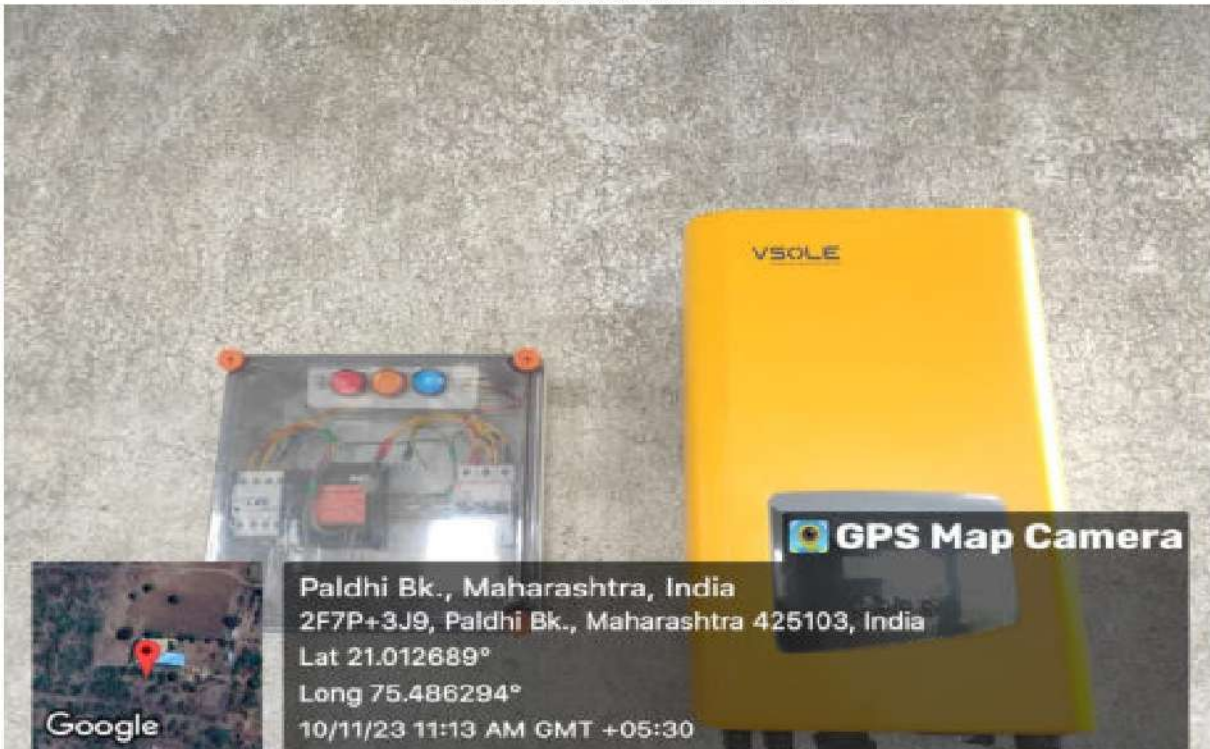
Solar Photovoltaic panel