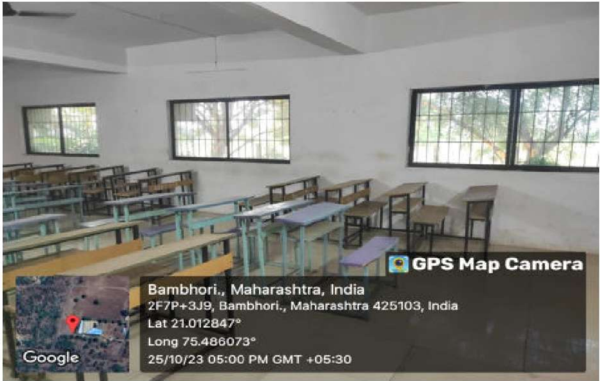
Well Ventilated and Sun lighted Classrooms