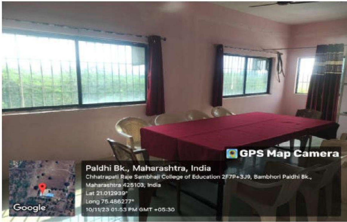
Well Ventilated and Sun lighted Staff Room

Gat No.181, Bambhori, Near K.B.C. North Maharashtra University Main Gate, Jalgaon Phone No. (0257)2234120