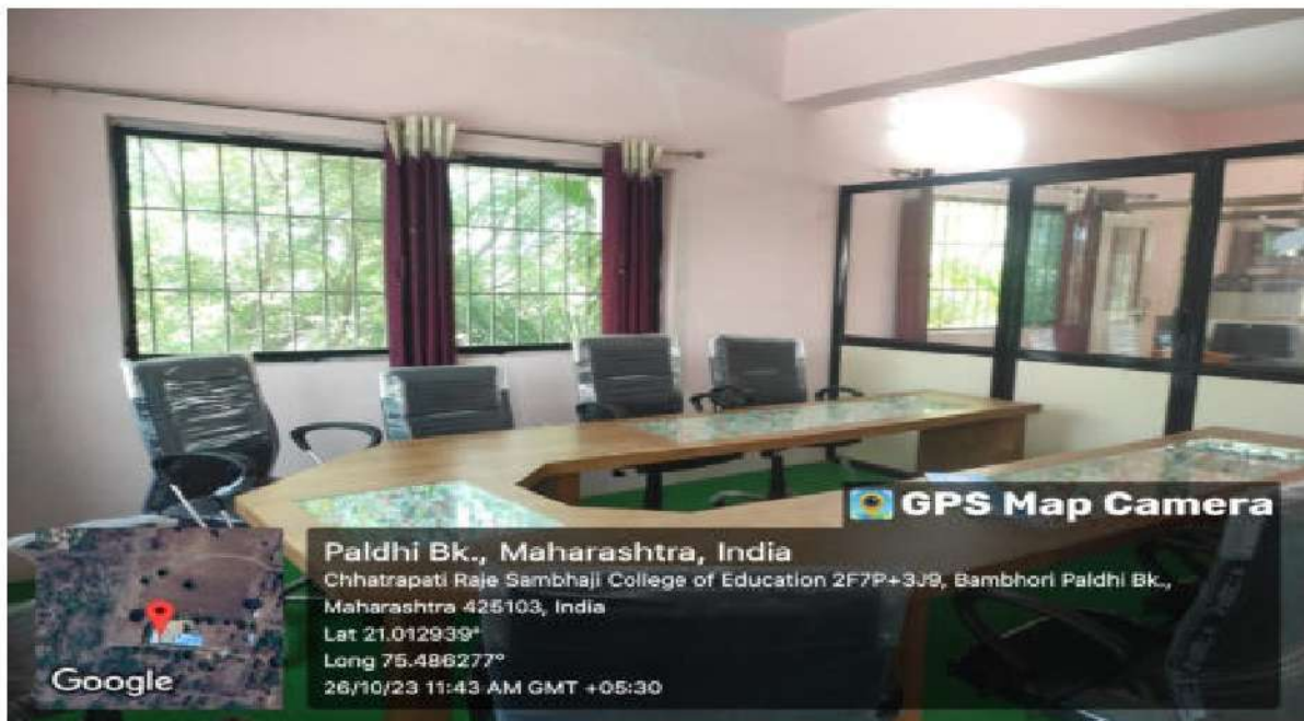
Well Ventilated & Sun Lighted Conference hall

IGAC IGAC Coordinator Chhatrapati Raju Sambhaji College of Education, Jalgaon